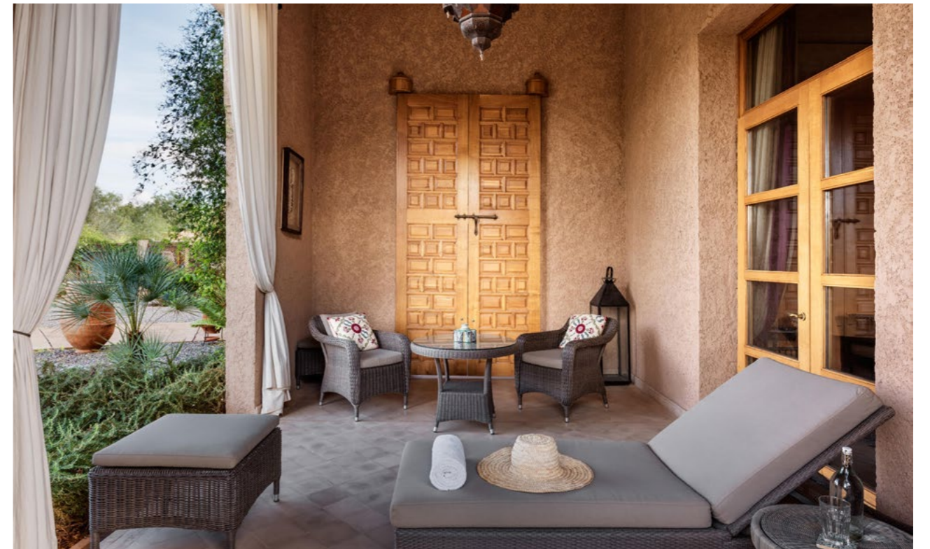
Ground Floor Bedroom Terrace