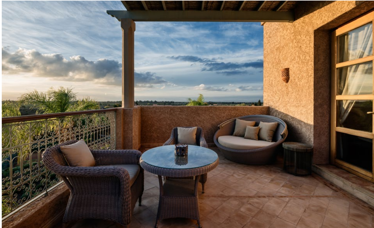
Garden Room Terrace