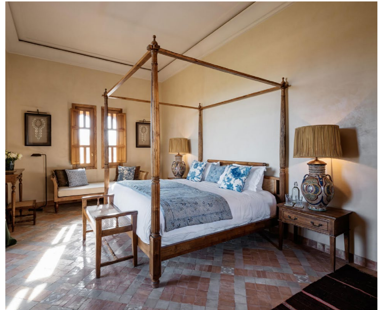
Principal Guest Suite