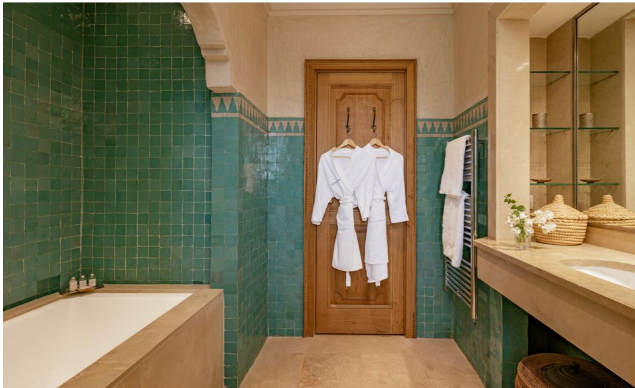
Garden Room Ensuite Bathroom