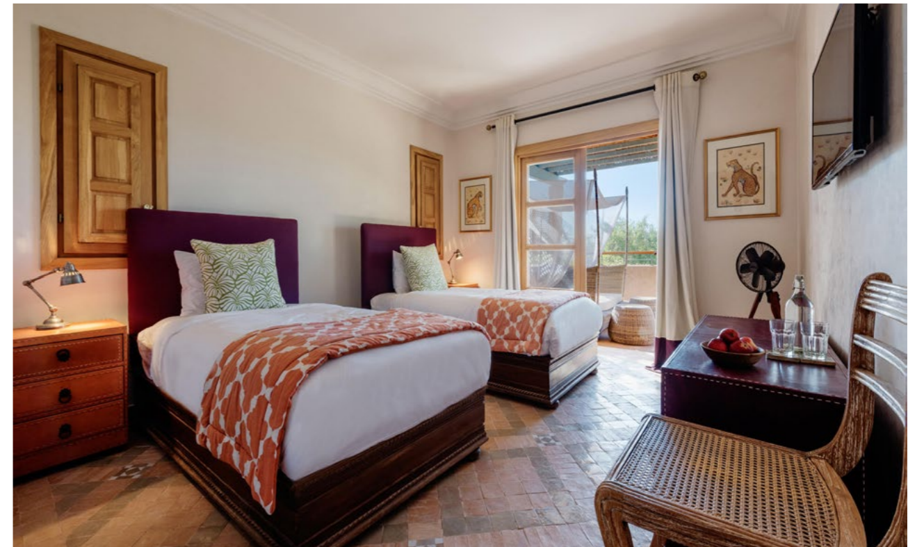
Guest House Twin Bedroom