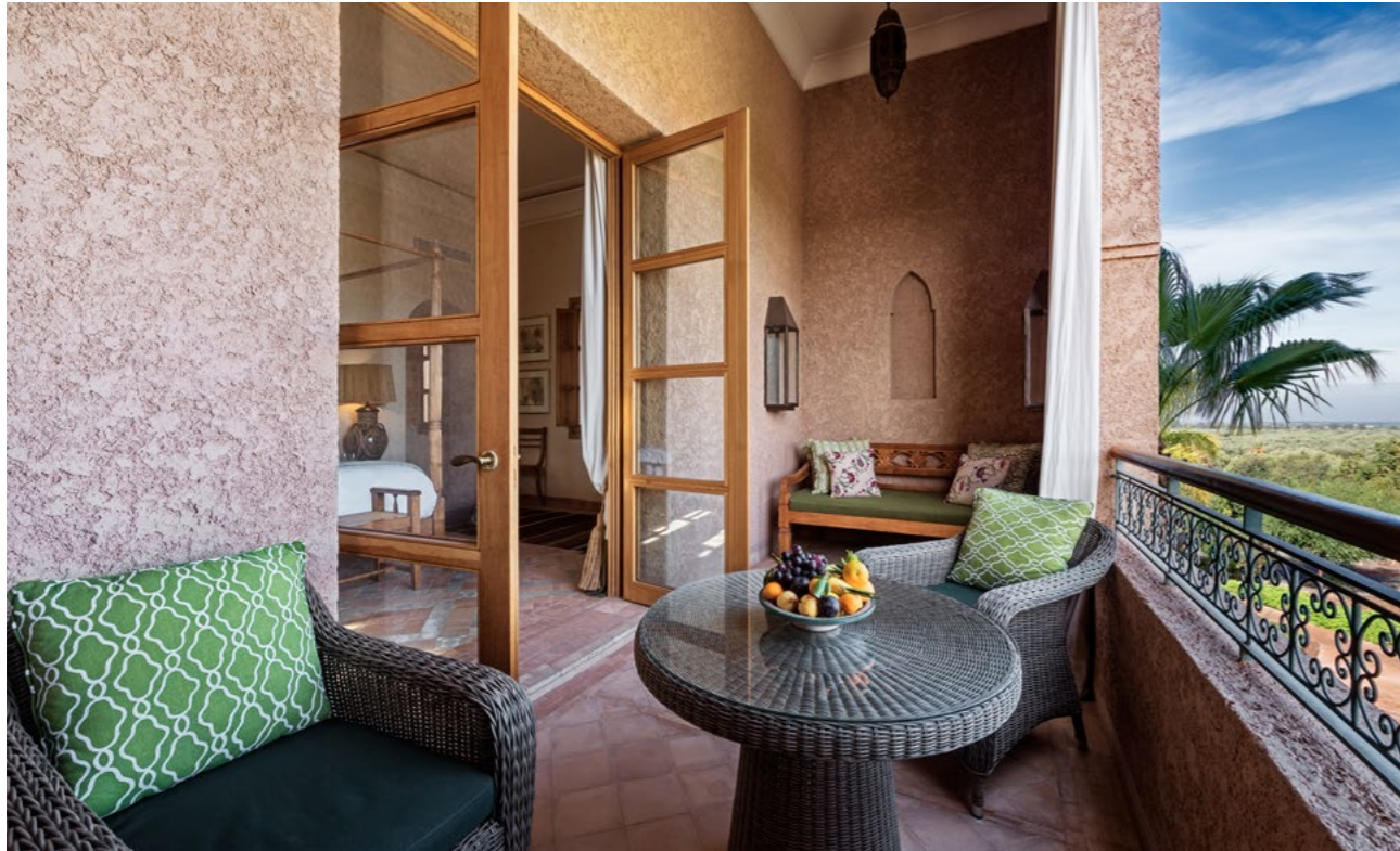
Principal Guest Terrace