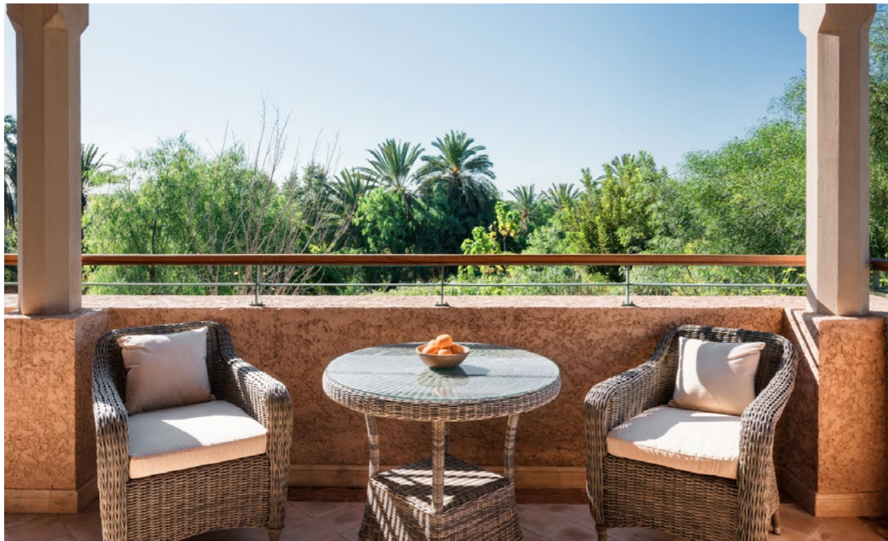
Guest House Terrace