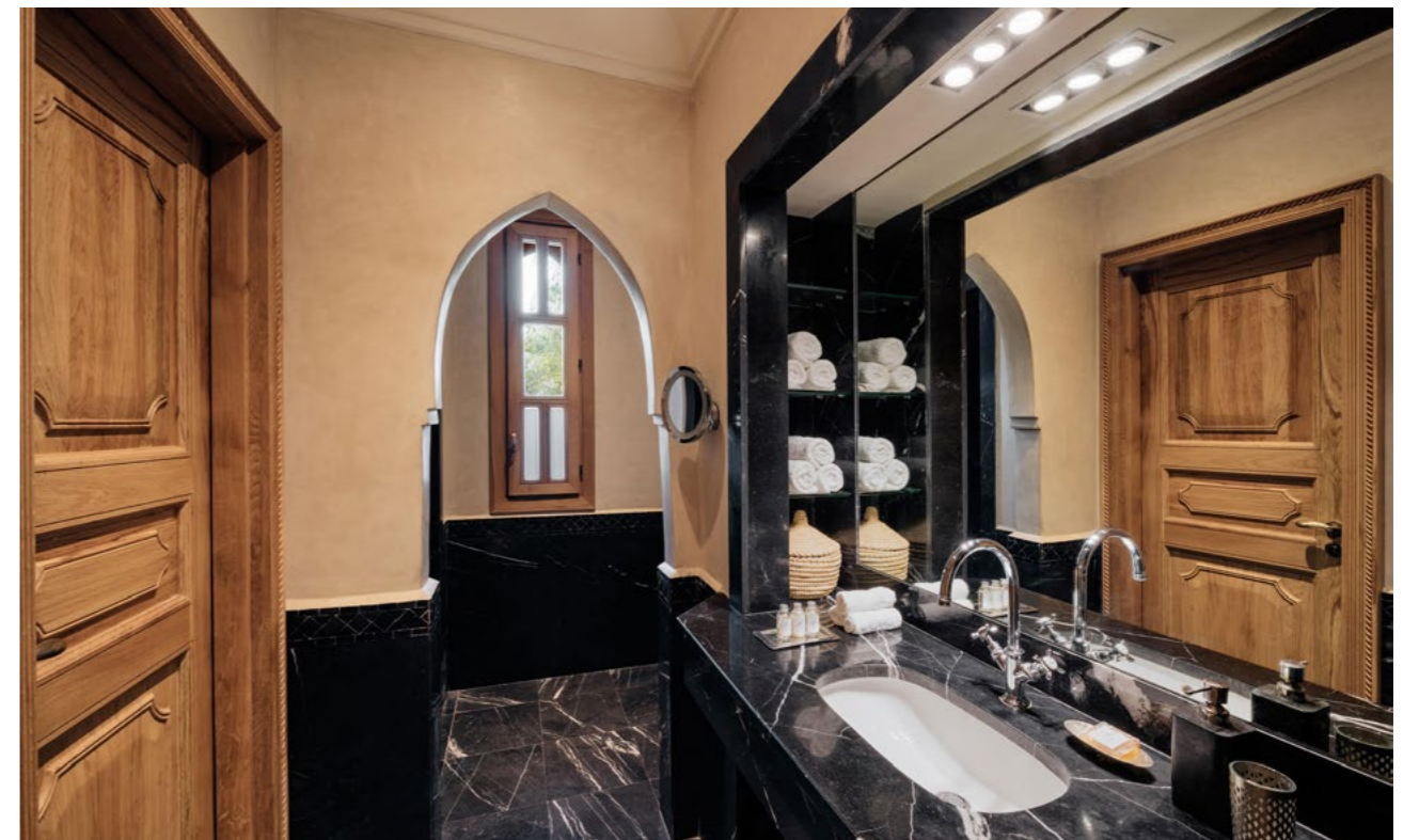
Ground Floor Bedroom Shower Room