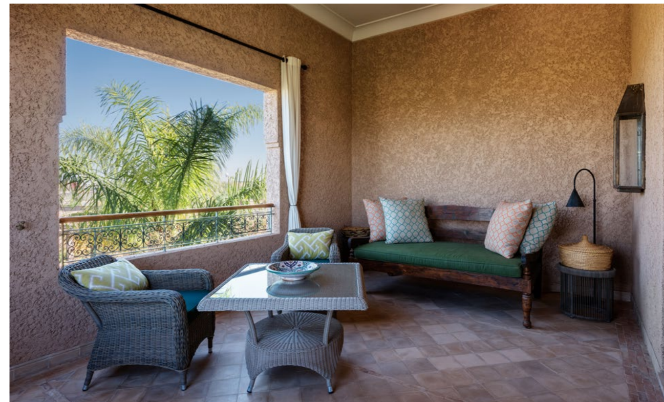
Pineapple Room Terrace