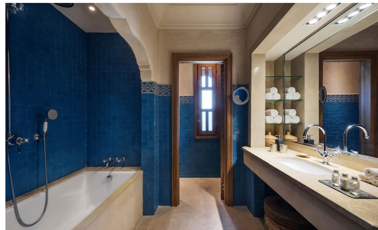
Pineapple Room Suite