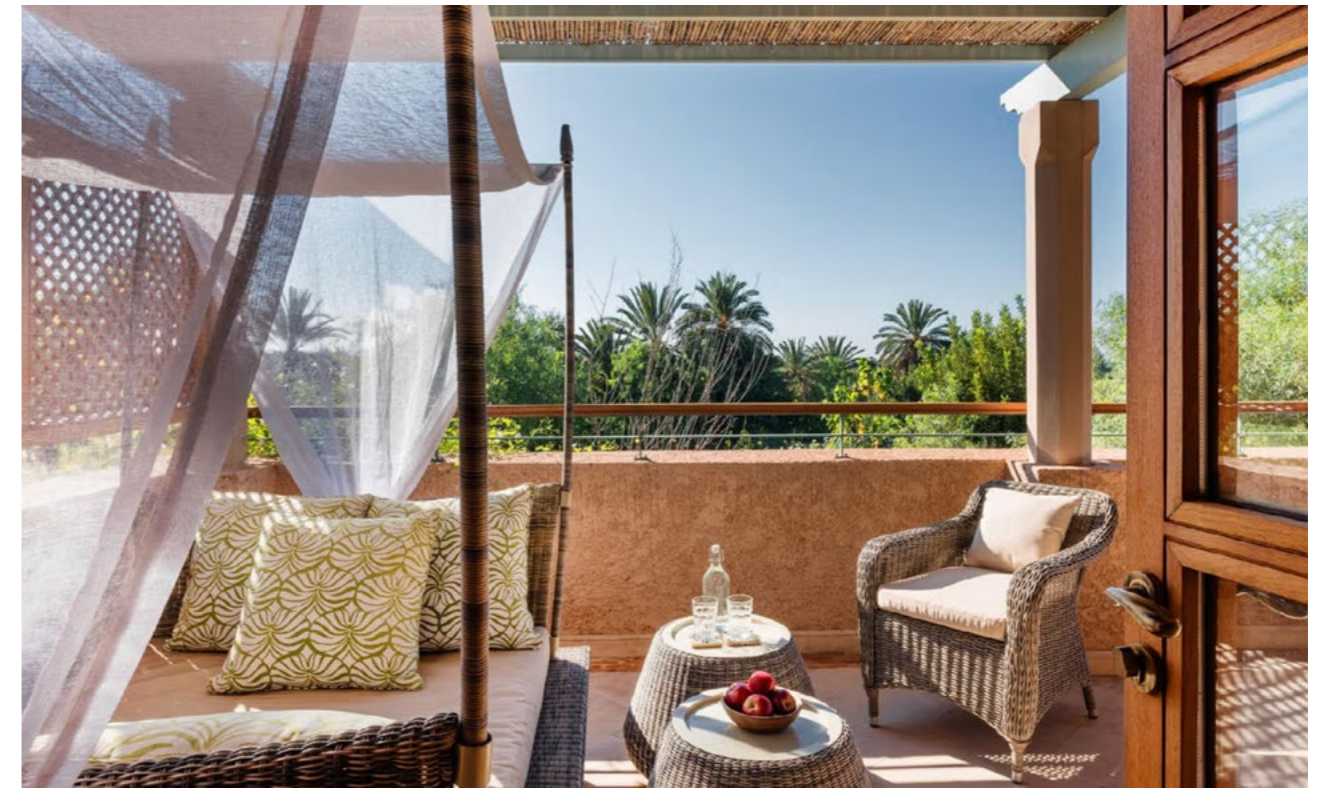
Master Bedroom Terrace