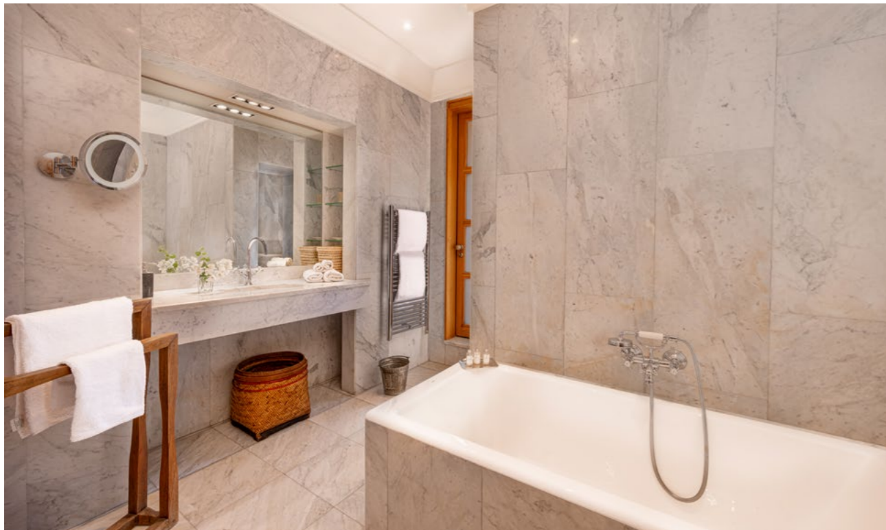
Principal Guest Bedroom Bath And Shower Room