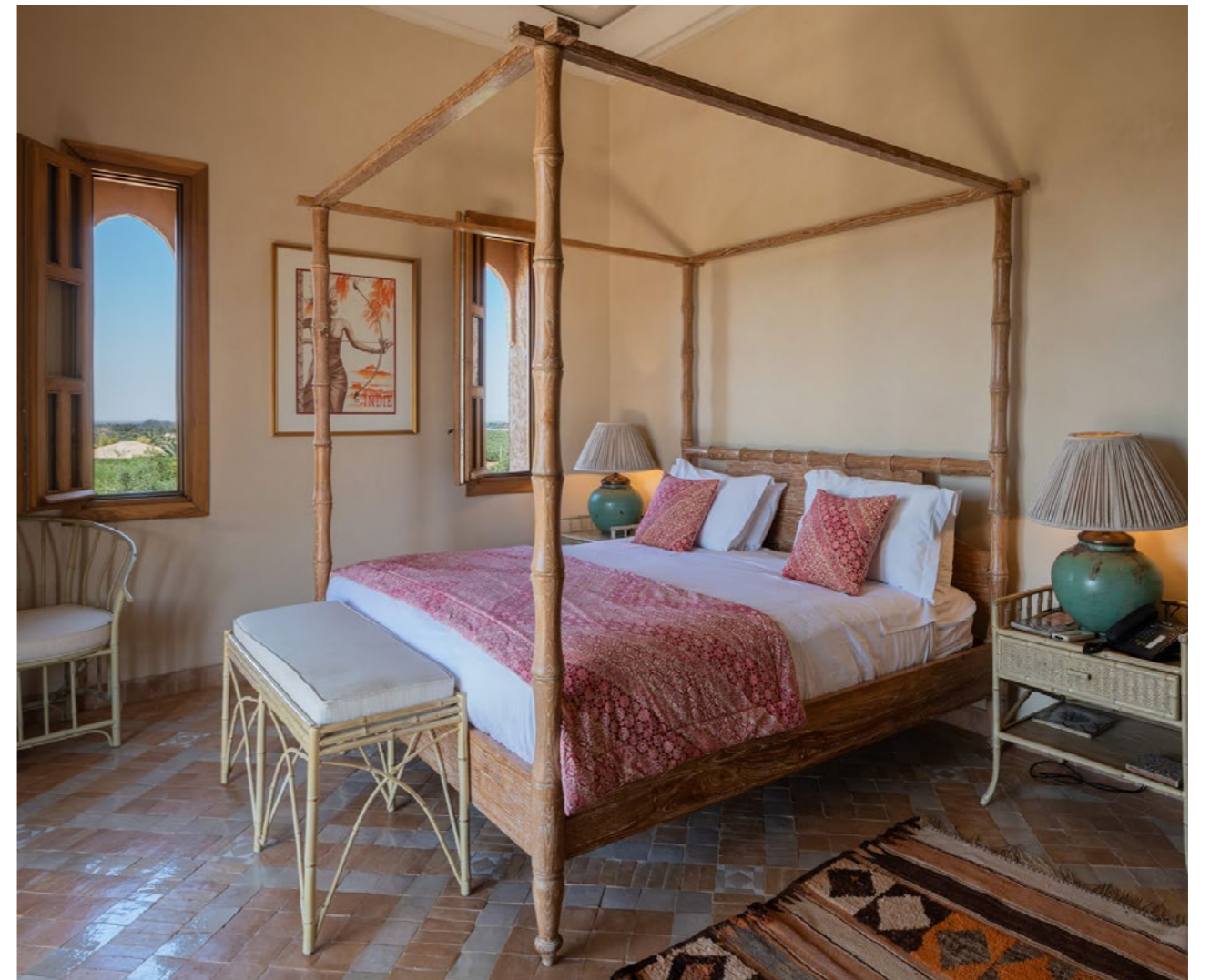
The Garden Room