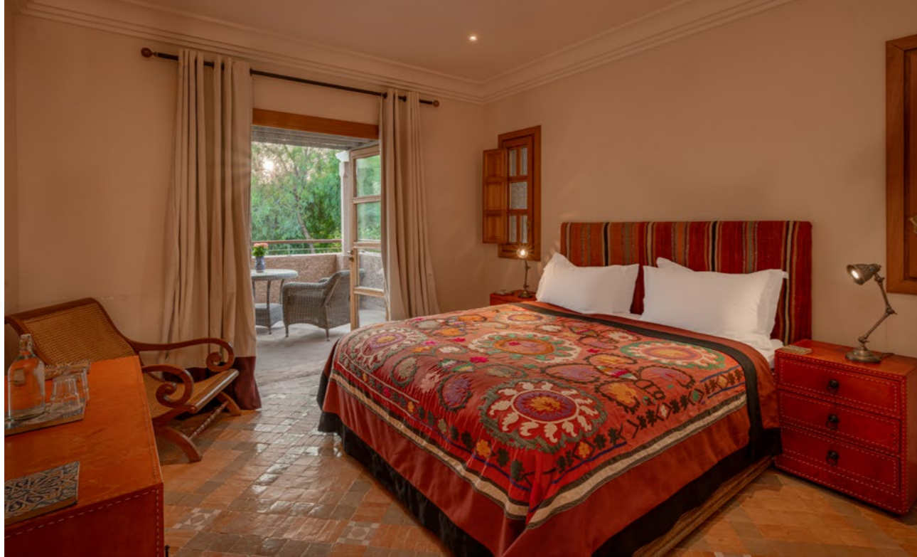
Guest House Bedroom