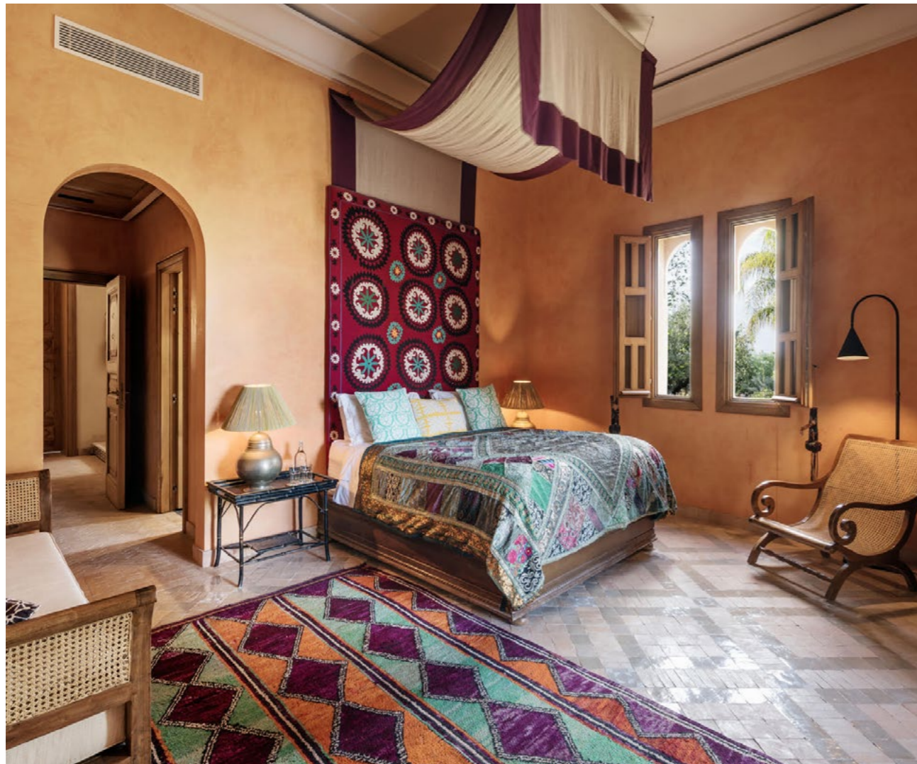
Ground Floor Bedroom Suite